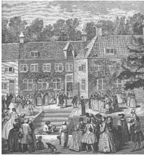
Anabaptist baptism at Rheinberg, Germany, 17th century