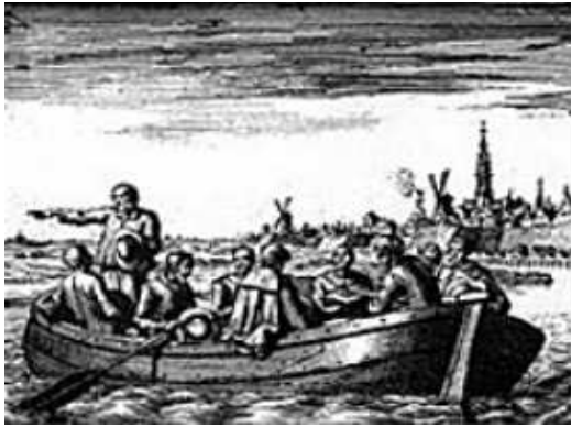
Anabaptist church meeting in a boat

Ambrosius Spitelmaier , a colleague of Hans Hut, asked under interrogation what Anabaptist meetings were like, explained: ‘They have no special gathering places. When there is peace and unity and when none of those who have been baptized are scattered they come together wherever the people are. When they have come together they teach one another the divine Word and one asks the other: how do you understand this saying? Thus there is among them a diligent living according to the divine Word.’